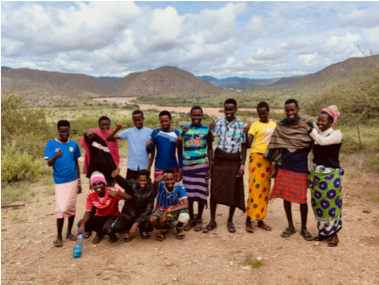
Our secondary students posing for a picture